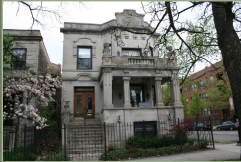
2959 W Logan (right top row photo)