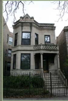
Ryan Mansion – 2819 W Logan (left bottom row photo)